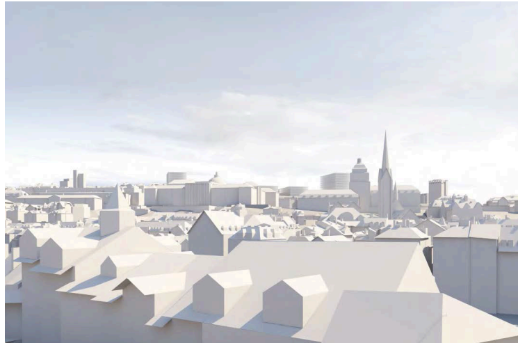
Figure 3. View of the design project developed by Team Gigon / Guyer, in the design competition in 2015

A master plan approved in September 2014 (EBP, 2014) provides a first outline for renovating the structural and operational infrastructures of the site over the next 30 years. For the city of Zurich, the area represents not only one of the most challenging tasks in the near future but is also supposed to serve as an incubator and demonstrator for a new inclusive planning process that connects the relevant actors and leverages synergies. Due to its complexity, integration of spatial development, energy planning and mobility is crucial for the success of the transformation in the end.