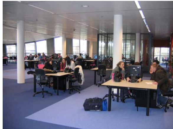
Figure 1: Avans Hogeschool

Left: workplaces in open settings and cockpits.