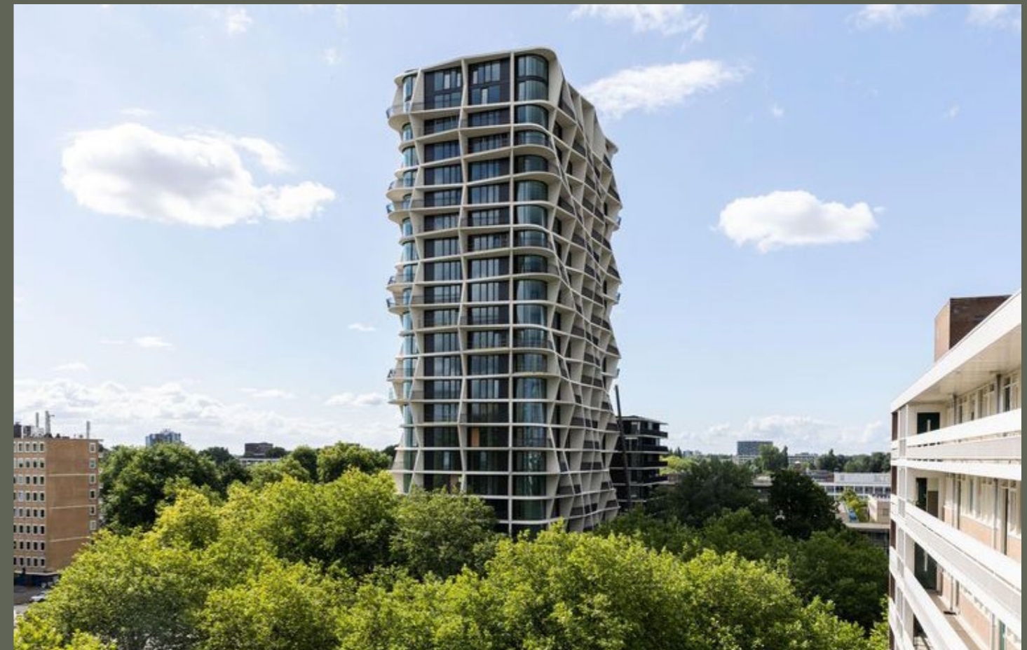
Figure 15 Quartz Tower's expressive facade rises high above Buitenveldert's flats and greenery, which breaks with the otherwise uniform built environment (Lucker, 2022).