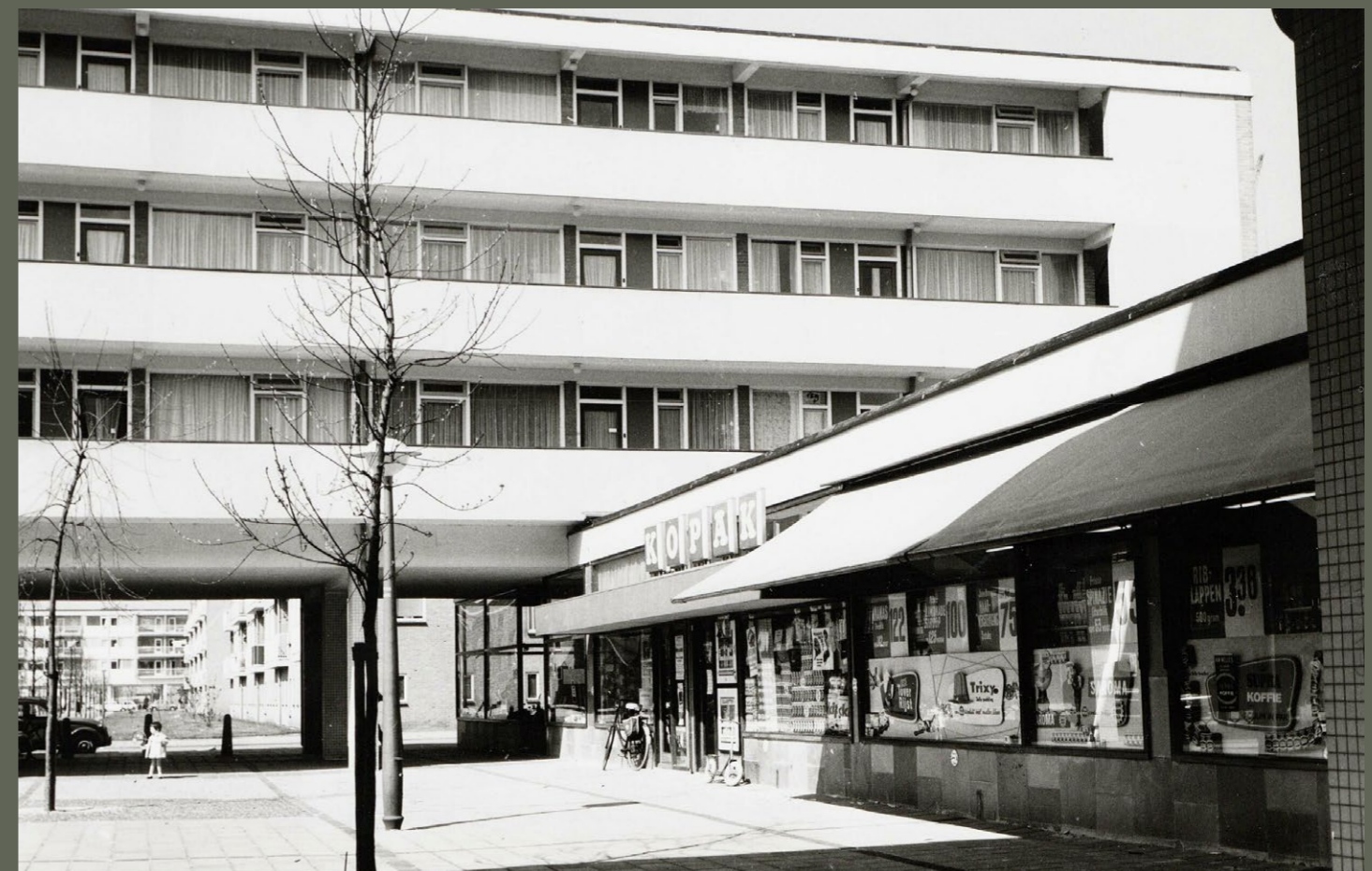
Figure 10 One of the many small shopping plazas located between Buitenveldert's buildings blocks (Stadsarchief Amsterdam, 1966).