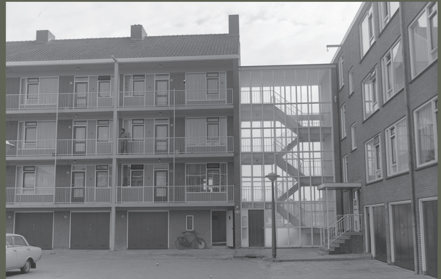
Figure 7 The access galleries and the glass entrance of my family's beloved flat.

The enclosed greenery between the flats, the courtyards, offered people of the neighbourhood a place where they could relax outside of their homes. Especially children made use of this space since various playgrounds were placed between the green spaces, see figure 8. My mother remarks: 'What was nice about growing up in Buitenveldert, was that you could always play safely outside in the courtyards until late at night. In the centre of Amsterdam that was more difficult and I was actually not allowed to do that. In the part of Buitenveldert where I lived, many children went to school with me, with whom I played outside in the afternoons and evenings in the playgrounds between the flats. That was fun.' The semi-open building blocks therefore created a lively and safe street environment by enabling children to play outside while residents could keep an eye on them. For other inhabitants, like for my grandfather, this green space however was less appealing (Aerts, 2022). A sufficient amount of bushes and trees were to be found on the grass areas but benches and tables were mostly missing. It didn't really function as a meeting place, like for example some community gardens do, since it wasn't designed that way. The green along the roads furthermore also didn't provide the inhabitants anything more than their green visual appearance. This can be