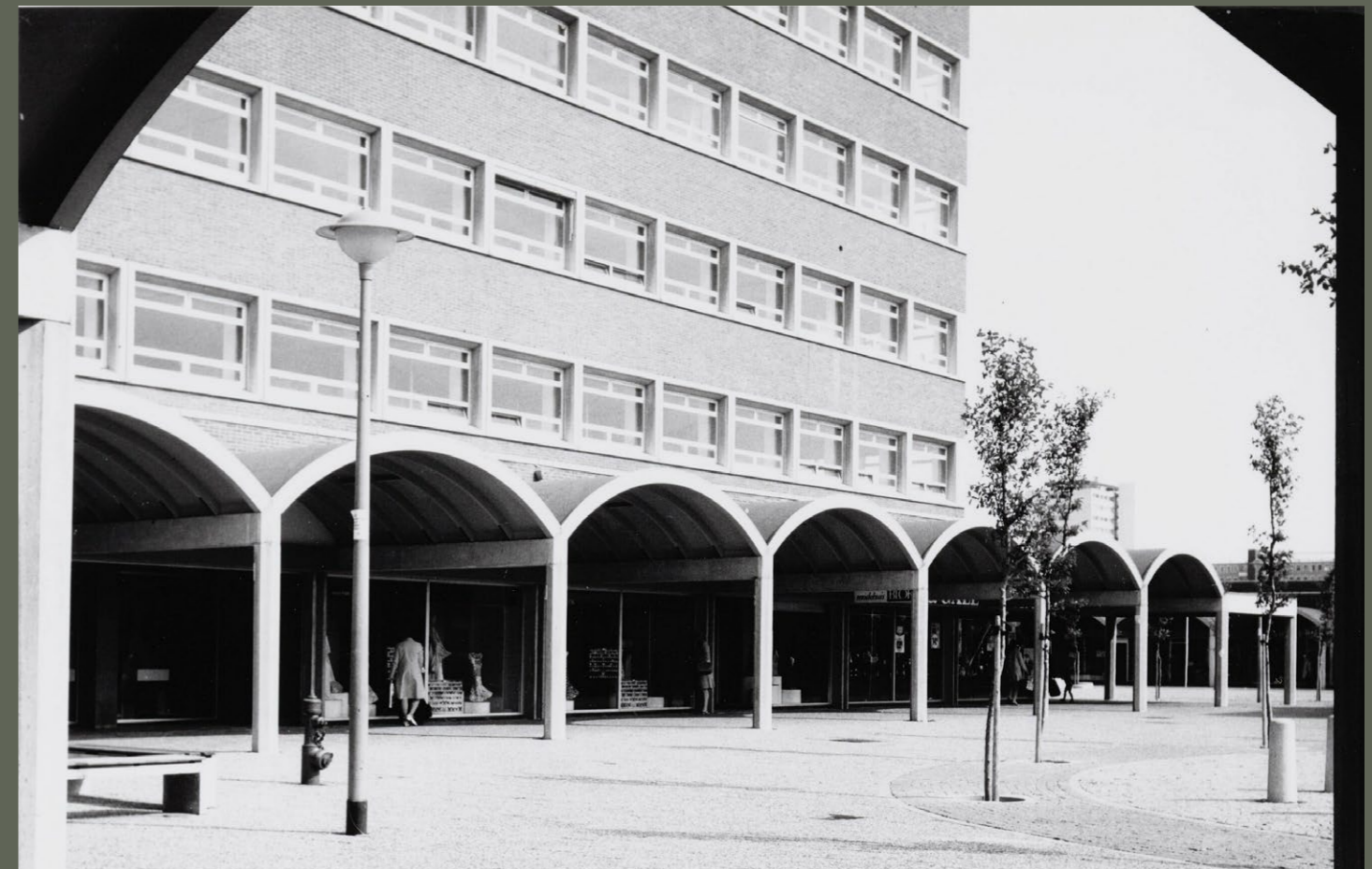
Figure 9 The arcades surrounding Gelderlandplein mall's original open squares where visitors stayed dry when it rained during their shoppings (Stadsarchief Amsterdam, 1970).

Since Buitenveldert contained most of the facilities that Amsterdam's centre also offered, the neighbourhood functioned quite autonomously, in line with the garden city concept that Van Eesteren had envisioned for the area. My grandfather only left Buitenveldert to go to the inner city for some specific shops that the neighbourhood didn't