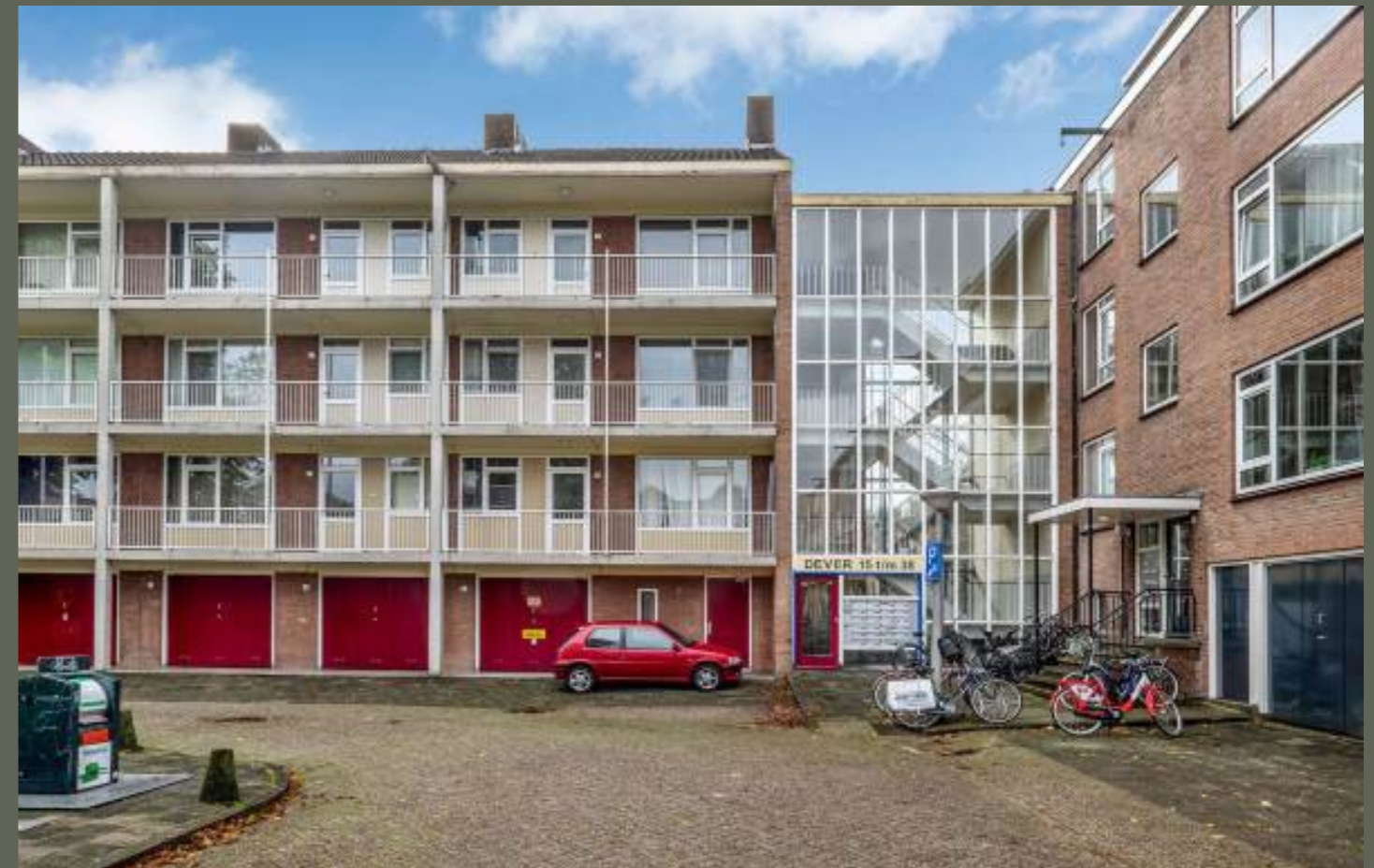
Figure 13 My family's flat has hardly changed over time, the access galleries and glass entrance have remained exactly the same (OOZO, 2022).

Although the designed layout for Buitenveldert remains mostly unchanged, the neighbourhood does have experienced some smaller redevelopments over time. One of which are the Q Residences, my mother pointed out. The Quartz Tower designed by Studio Gang, with its glass facade and prominent wavy balconies, rises dramatically above the neighbourhood (Huisman, 2022), see figure 15. This recently completed project gives Buitenveldert a landmark which breaks with Van Eesteren's envisioned uniform streetscape that has been created by the homogenous looking flats. Interestingly, tenants aren't allowed to place plastic chairs and other cheap-looking mess on