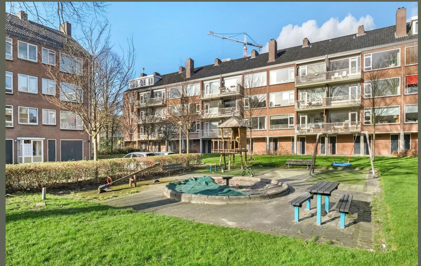
Figure 14 No big changes were made to the courtyards, other than replacing the original playground equipment and the addition of some benches and tables (OOZO, 2023).