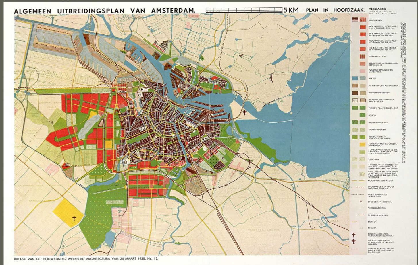
Figure 1 Amsterdam's Algemeen Uitbreidingsplan with the Westelijke Tuinsteden and Buitenveldert indicated in bright red. Buitenveldert is the area south of the darker red city centre (Van Eesteren, 1935).

The English garden city movement and the German evolution of the building block together formed the foundation of Van Eesteren's design for Amsterdam's expansion.