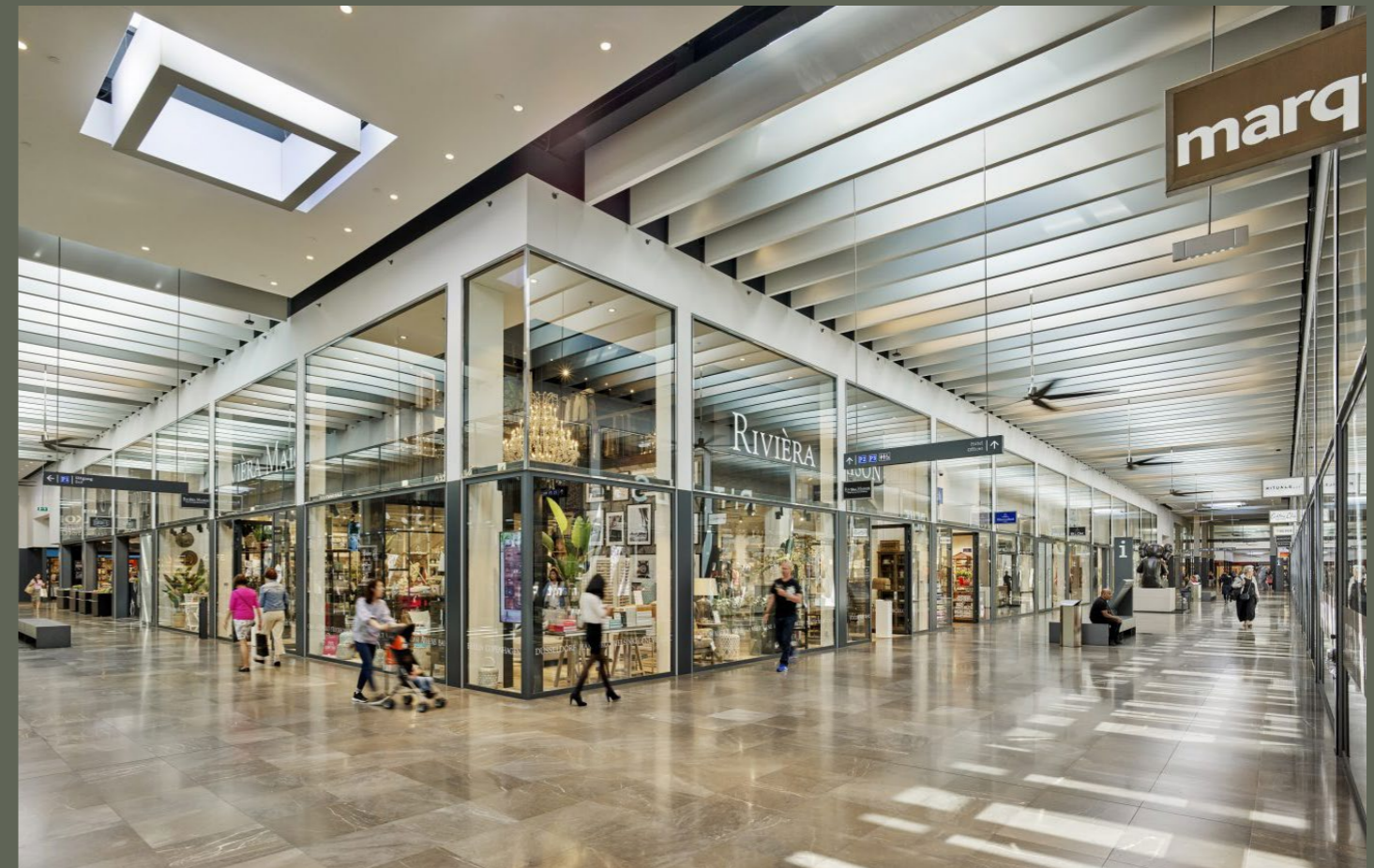
Figure 16 Gelderlandplein mall's current luxurious appearance, created by its roof and larger/more expensive stores (Kroonenberg Groep, 2016).