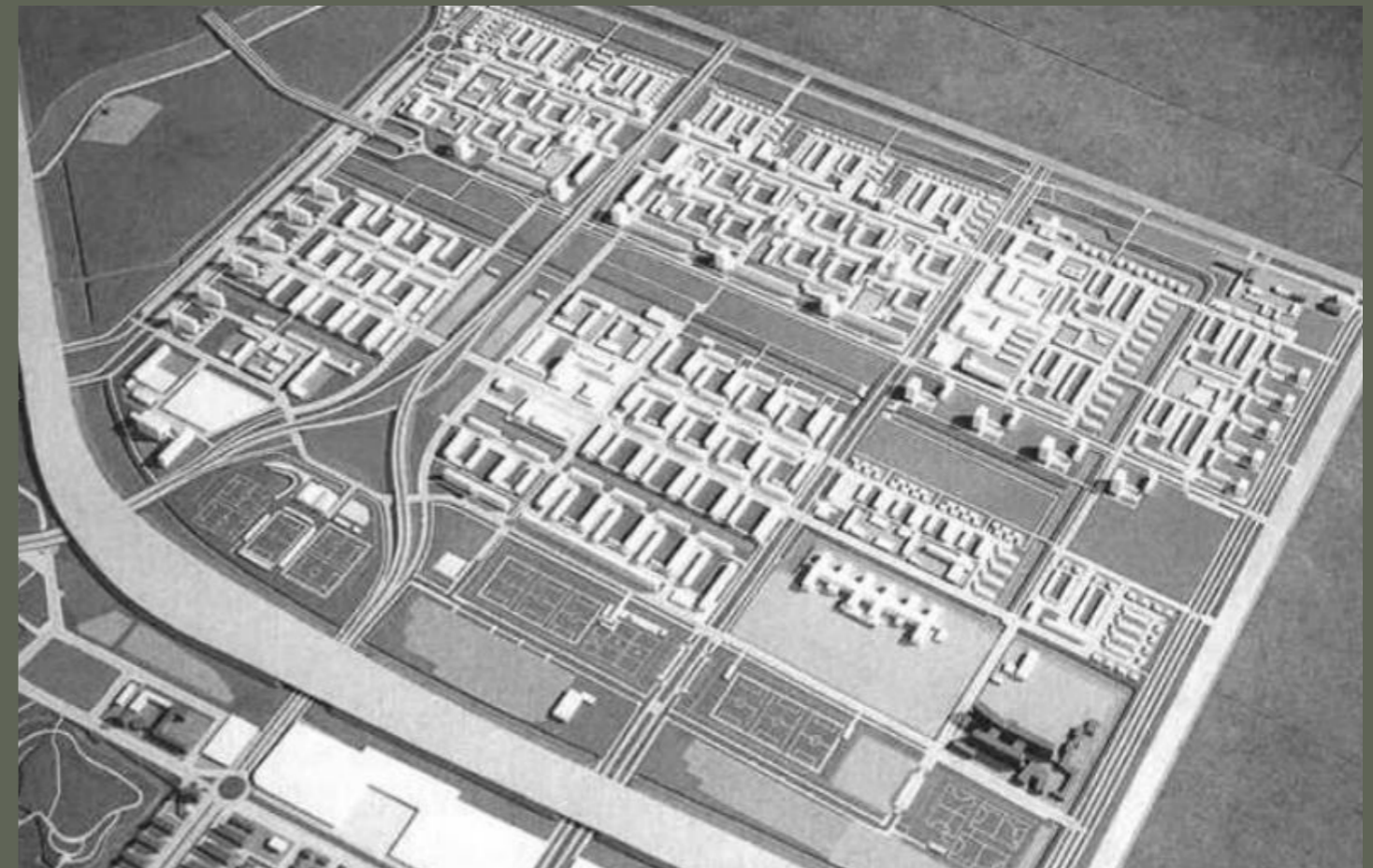
Figure 4 Physical model of Van Eesteren's radically modern layout for Buitenveldert, seen towards the south (Ons Amsterdam, 1961).