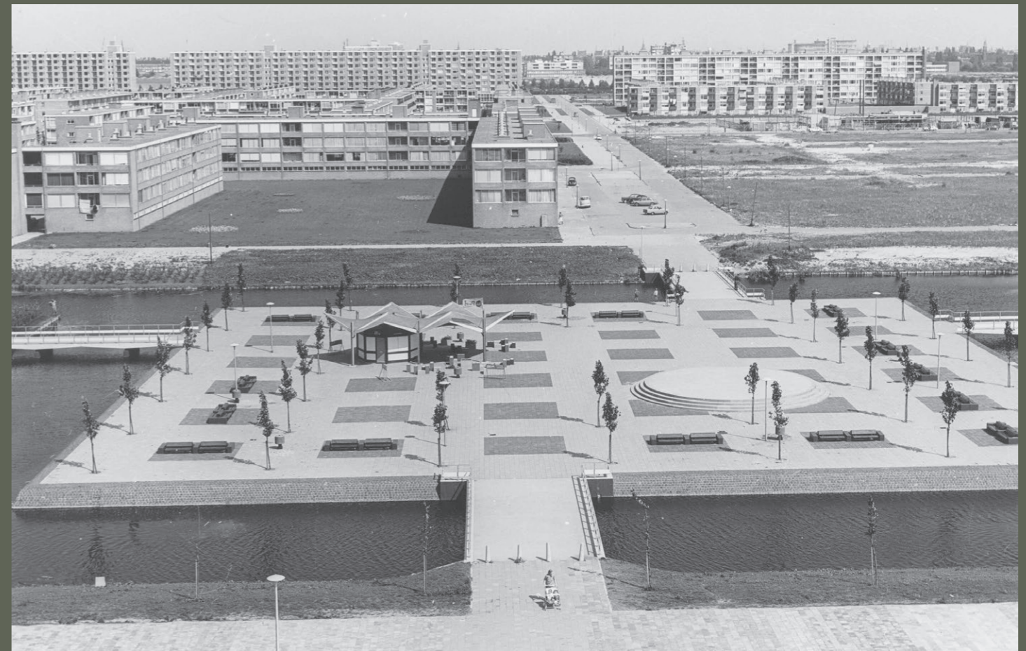
Figure 11 Gijsbrecht van Aemstelpark's central island with the kiosk 'Consumptie-tent' at the time when the last trees were planted.

have at the time. My mother together with my grandmother, only went there for late night shopping on Thursdays. At first, the infrastructural connection between Buitenveldert and the city's centre wasn't well thought of (Vrije Universiteit Amsterdam, 1998). One of the few transit options, bus 23, didn't drive consistently and wasn't really reliable, inhabitants complained. My grandfather stated: 'I wouldn't say Buitenveldert was very isolated, but it was definitely not so easy to get to Amsterdam's centre'. This perception slowly changed when tram line 5 was extended south towards Amstelveen, and now also stopping in Buitenveldert (Vrije Universiteit Amsterdam, 1998). For my grandfather, the downsides were that his beloved strip of green in the middle of the Buitenveldertselaan had to make way for the tram and that it got busier on the otherwise quite calm streets, see figure 12. Simultaneously, more people moved to the area due to the better connection with the surrounding areas, like wealthy Japanese businessmen that worked in offices in the city, my grandfather explained. Quite soon after its completion Buitenveldert, functioned already less as a garden city and more like a typical suburban neighbourhood that's dependent on the city.