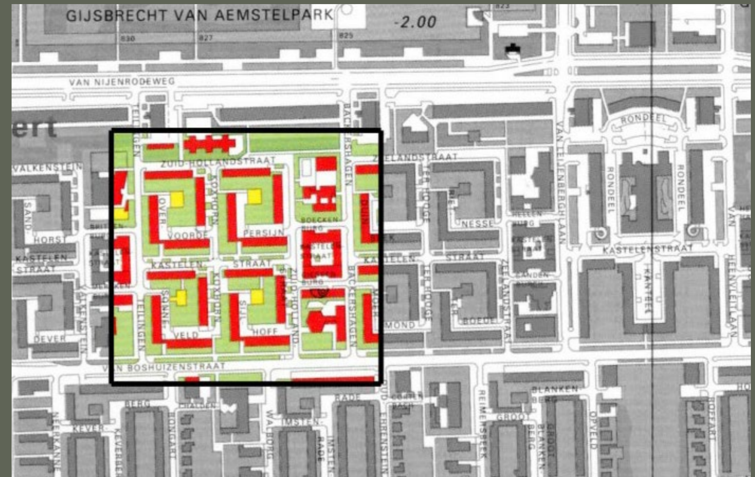
Figure 5 The semi-open building blocks, created by two L-shaped flats, form a unique open allotment principle that can be found throughout Buitenveldert (VLUGP, 2001).

With his design for Buitenveldert, Van Eesteren intended a place with lots of greenery as well as his three key principles: light, air and space (Van Eesterenmuseum, 2022). According to him, residents should live in houses with sufficient natural light by creating open space between the housing blocks. Parks, playgrounds and sports fields would allow the inhabitants to enjoy the fresh air and outdoors as much as possible. In that way he imagined a pleasant life being lived in a spacious and green area. Van Eesteren himself regarded his design for Buitenveldert as the most successful plan for Amsterdam's post-war expansion. He stated that 'if you really want to know how the AUP was intended, go see Buitenveldert' (Van Eesterenmuseum, 2014a). The ideas of the garden city and a new open allotment, in combination with offering sufficient facilities and better housing, have made Buitenveldert a wealthy modernist neighbourhood. This stands in stark contrast with Amsterdam's historical centre, just how Van Eesteren had envisioned.