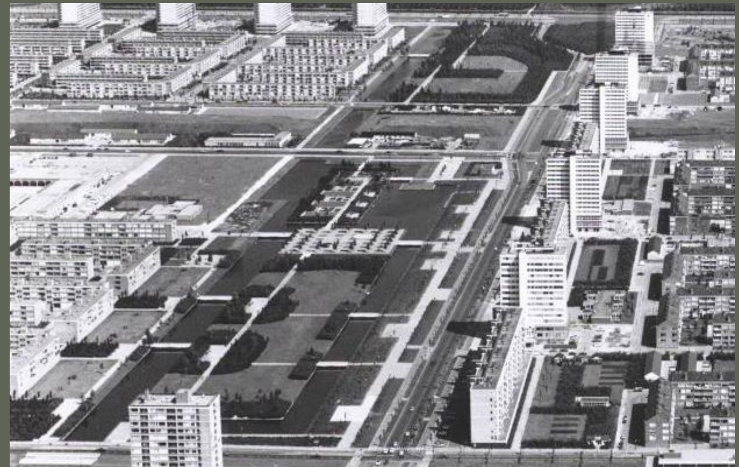
Figure 6 Aerial view of the Gijsbrecht van Aemstelpark, Buitenveldert's main public green space, seen towards the east (Gemeente Amsterdam, 1968).