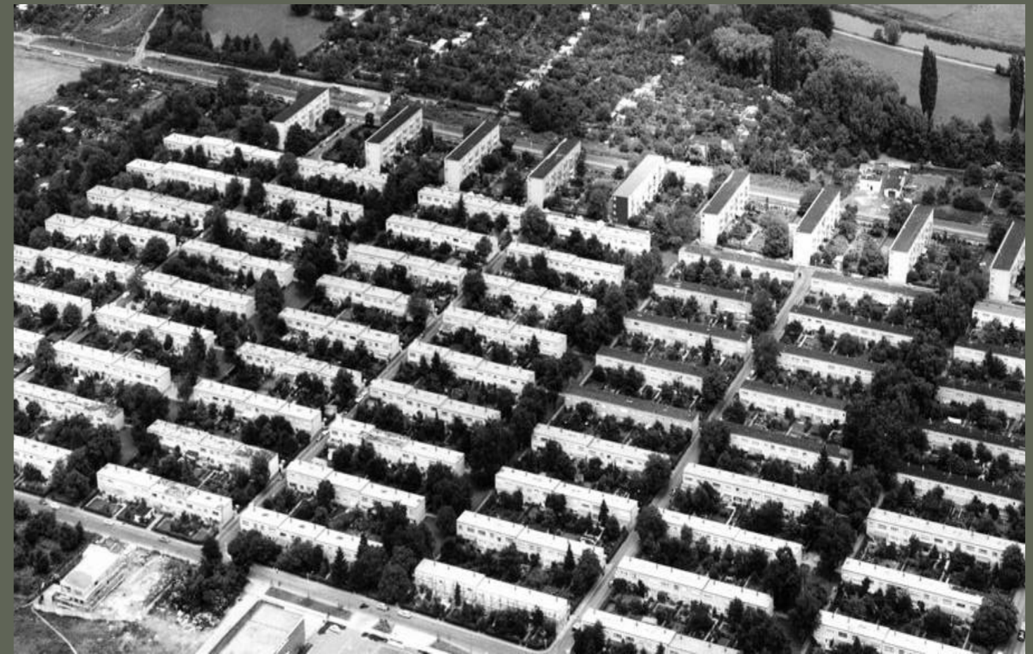
Figure 3 Siedlung Westhausen's modernist open allotment created by the rigid yet green grid that has nothing to do with the city's traditional layout (Aero-Lux Büsscher & Co. KG, 1932).

Not only the built environment was important in creating Buitenveldert's radical homogenous appearance, attention for public space and especially greenery were just as important for this modernist urban plan. The Gijsbrecht van Aemstelpark, a broad 2 kilometre long green strip, was constructed to connect the existing green structures in the west (Amsterdamse Bos) with the east (banks of the river Amstel, later the Amstelpark), see figure 6. The park's layout, designed by Wim Boer and finished in 1968, consists of a meeting island in the middle, a kiosk, a playground and a flower garden (Van Eesterenmuseum, 2014b). Besides this open public green space, greenery throughout the entire neighbourhood was intended to complement the sober and repetitive architecture of the building blocks. The street side of these blocks for example, contained less relief in the facade and unwelcoming closed plinths which are compensated by rows of plane trees. Within the courtyards of the semi-open building blocks, more variation in plants and trees can be found. Free stranding monumental trees were placed as counterpoints in between planes of grass and other plantations. Moreover, landscape architects used contrasting coloured planting in relation to the buildings' colours, like