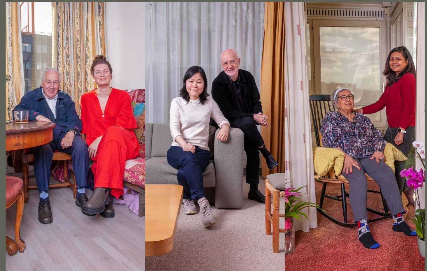
Figure 17 A more diverse group of residents can be seen during interviews where they discussed topics like meeting places and the lack of social cohesion (Coppejans & Stichting Open Mind, 2022).

Looking at how Buitenveldert is regarded by its residents, hardly any large complaints can be discovered. There's little criminality in the area and the quality of the public space and greenery is highly ranked. The neighbourhood is seen as a child friendly place, partly due to the many playgrounds (in the courtyards), and scores high on aspects like street cleanliness and the amount of parking space, see figure 18. The overall satisfaction among inhabitants was a 7,9 out of 10 in 2021, making Buitenveldert on average a good neighbourhood to live in. Van Eesteren's radical design for a mixed function and green neighbourhood, provides a quite liveable environment for its inhabitants, even after almost 65 years. 'I find it very comfortable here in Buitenveldert. You have everything here', my grandfather proudly states.