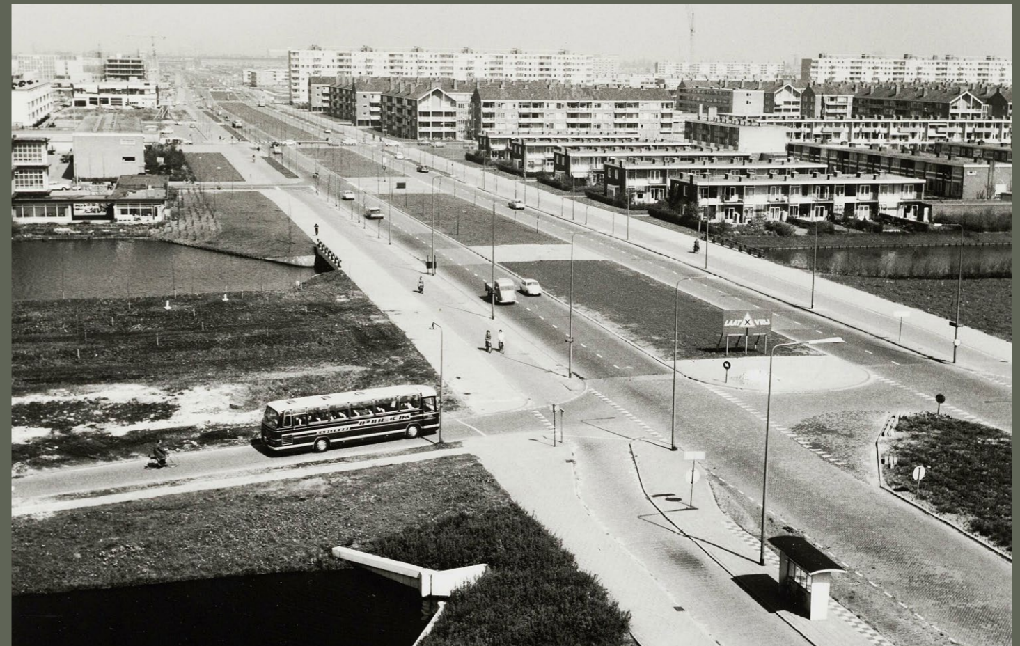
Figure 12 Buitenveldertselaan before tram 5 was extended with in the middle the strip of green and bus 23 in the foreground (Stadsarchief Amsterdam, 1966).