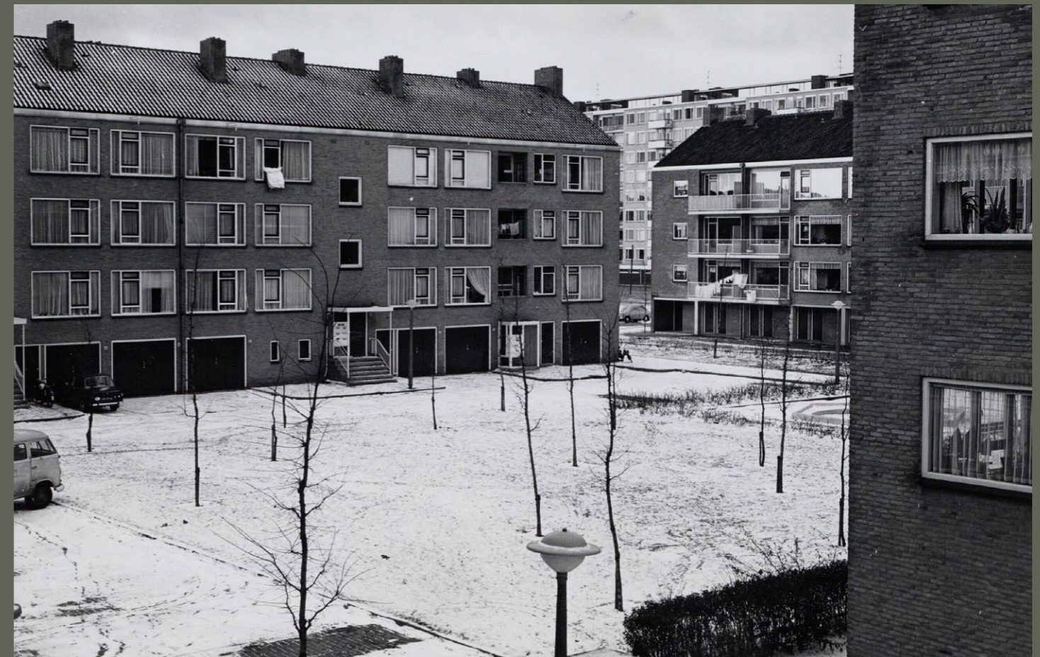
Figure 8 The courtyard of my family's beloved flat with a glimpse of the playground, located just behind the right building.