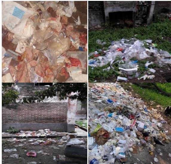
Figure 1: Wastes thrown at unauthorized place in RMCH