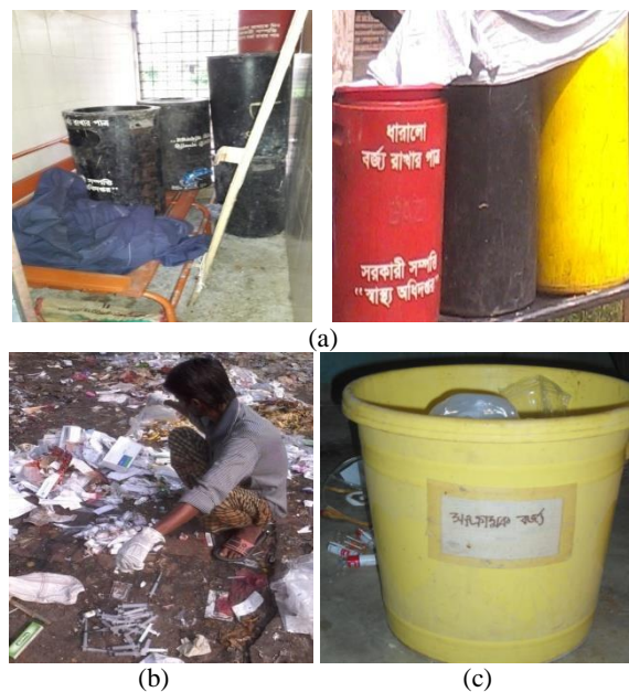
Figure 2: Improper on-site storage of medical wastes: (a) Colour coded containers are not in use, (b) Using plastic bucket, (c) Some saleable wastes are picking by scavenger

points. Some medical wastes are also accumulated into the internal drain of hospital.