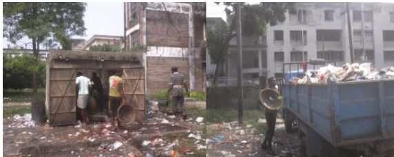
Figure 4: Waste collection crew of RCC transferring waste to transport vehicle