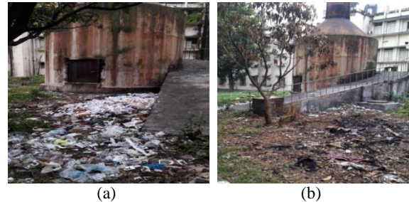
Figure 5: Incinerator in RMCH: (a) Supposed to use for incineration of hazardous medical wastes, (b) Open burning place of hazardous medical wastes.

processing facilities for municipal wastes and even for medical wastes. They disposed of all types of wastes following open dumping method. The disposal of medical wastes along with the municipal waste is a threat to the surrounding environment as well as public health.