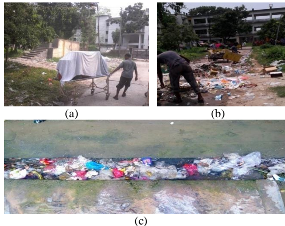
Figure 3: Medical wastes collection scenario: (a) Waste carrying to the primary dumping point inside RMCH, (b) Illegal dumping of medical waste, (c) Wastes accumulated in internal drain