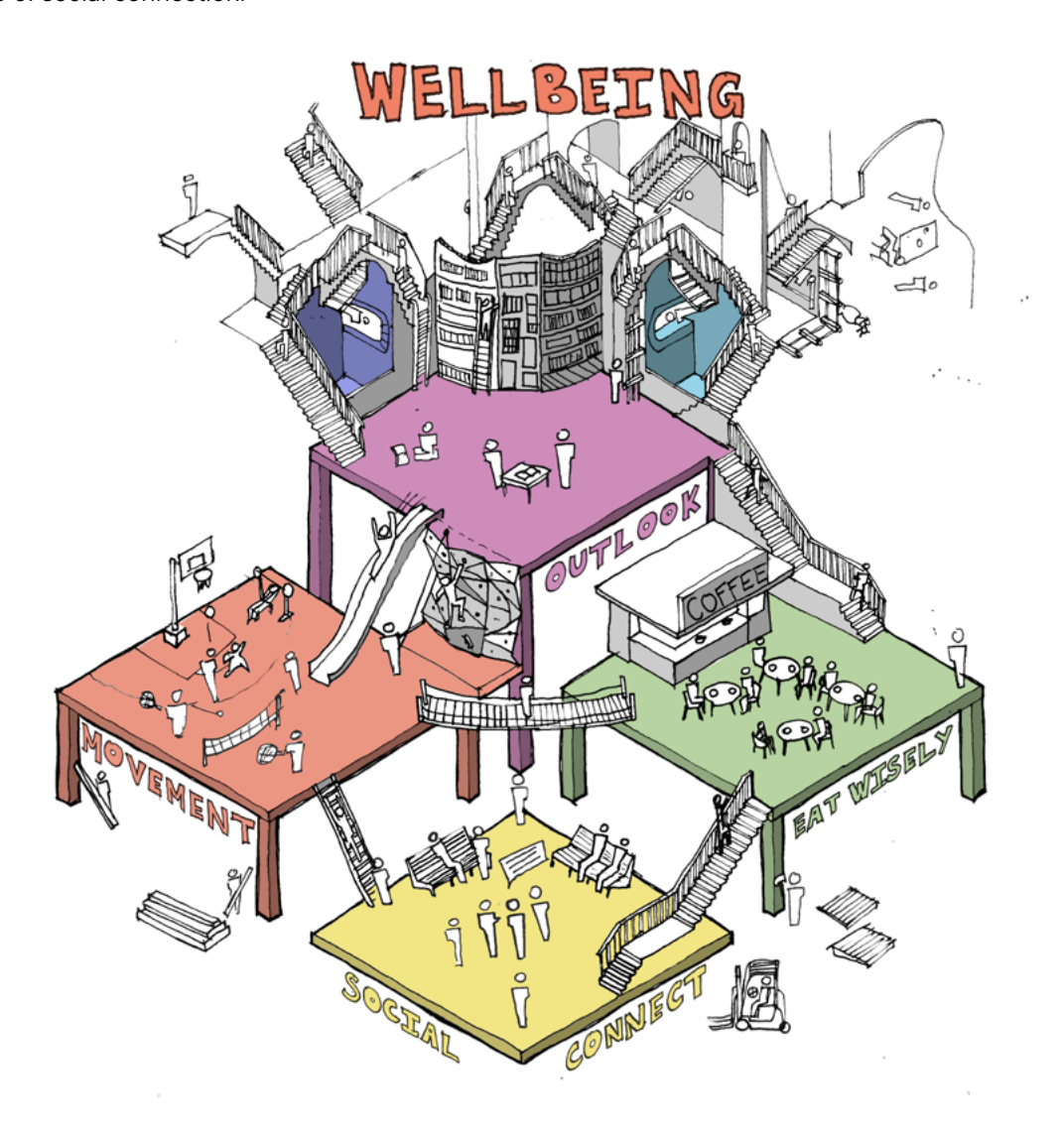
Fig. 1: Concept Drawing - 'Architecture supporting Social Connection as a Catalyst Towards Well-being' by Author

The graduation project topic, which aims to address the research question 'How can the architectural design of elderly independent living environments enhance well-being by promoting social connections amongst the elderly?', explores the relationship between elderly well-being and architectural design. Specifically, it explores how architecture can leverage its ability to create spaces for social connection and therefore activate it as a catalyst for the promotion of well-being. The relationship that this has with Architecture, Urbanism and Building Sciences is the contribution of a vision where the built environment is able to support continued healthy independent living by creating dwelling environments that position elderlies within a community that has a strong sense of social connection.