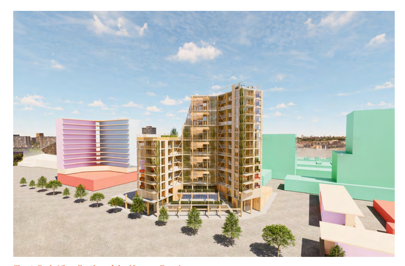
Fig. 4: Early Visualization of the 'Orange Zone'

To conclude, I learned a lot about architecture, technical design, research and even myself and the way I think on this journey. I am excited to present the 'Orange Zone' in my upcoming examination and my public defense on June 18th.