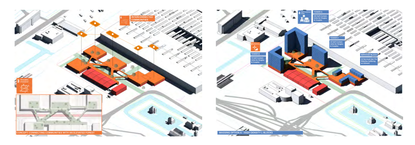
Fig. 2: Early Masterplan Massings Developed Using The Application of Design Guidelines for the P2 Presentation.

As I developed my design, I found myself critically evaluating the research guidelines as I tried applying them. I noticed that there was a clear hierarchy with regards to which design guidelines popped up in to my head as I was trying to create ingenuitive solutions to manifest my vision. When I look at my building, I notice that a lot of the creative ingenuity came through the ways in which I interpreted the guidelines that are positioned in 'Scale B - Communal'. This feels obvious, as the research is all about social connection, but in hindsight it might be helpful for the research to place a little more emphasis on this, while showing that the other scales are there to support the main idea.