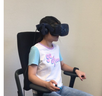
Fig. 1: 360VR HMD-based annotation tool. (a) Valence-Arousal model space based on Circumplex model [1]. (b) Hardware set-up. (c) One user in our tool, wearing HMD, Empatica wristband, and annotating with Joy-con controller.