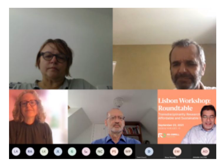
Figure 1. The roundtable participants of the 4th session of RMT1