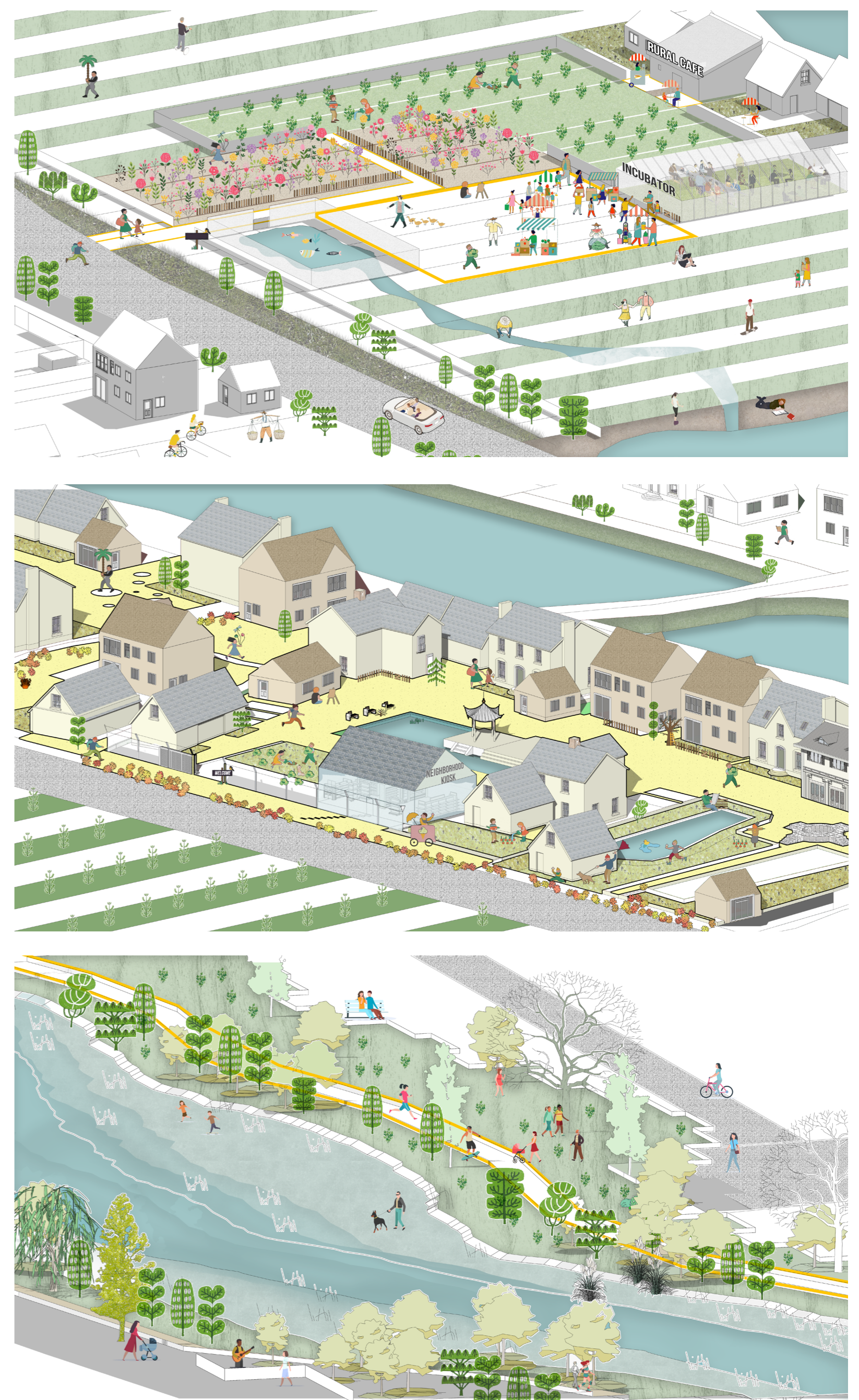
Figure 4. Pilot projects