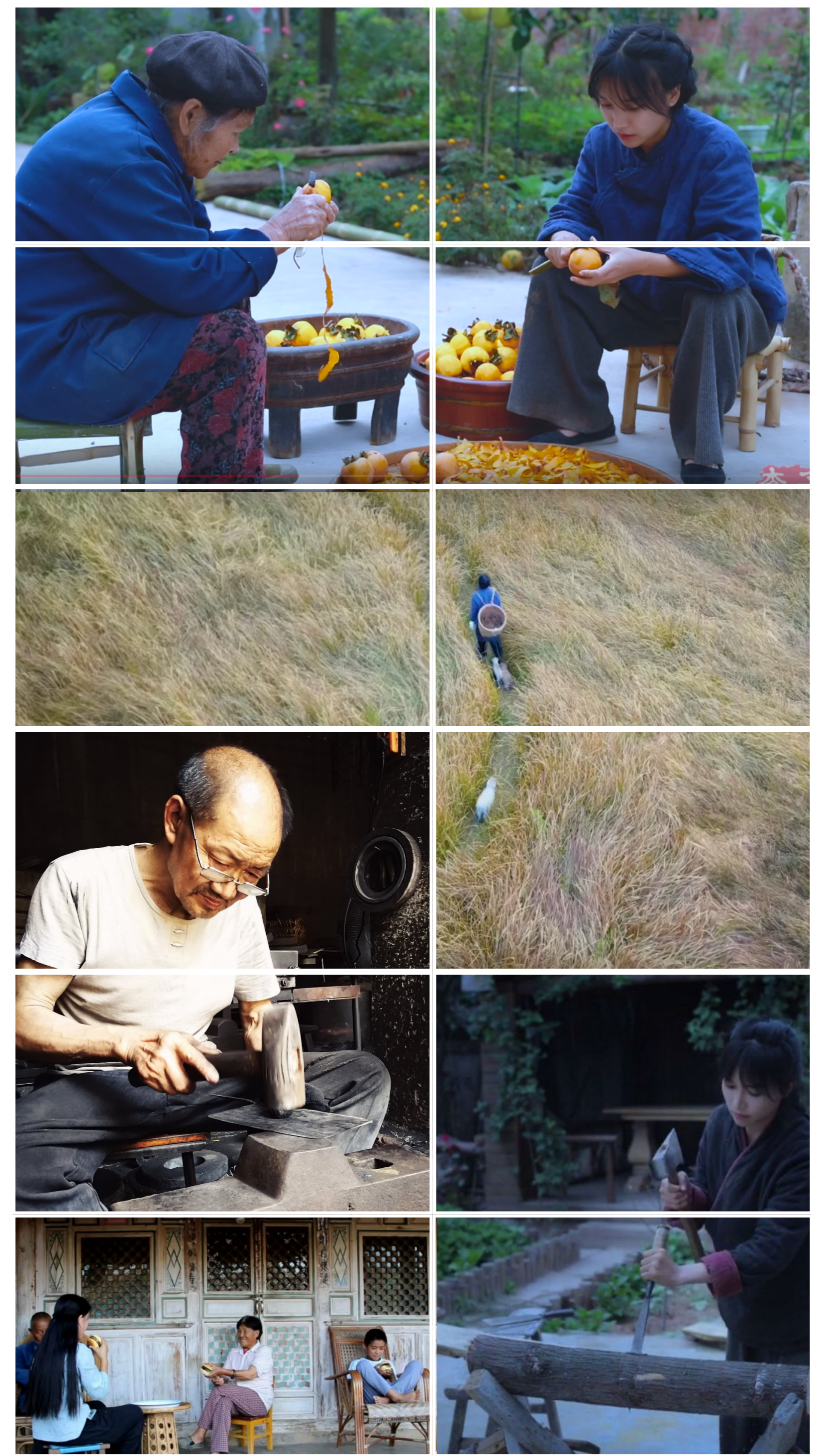
Figure 2. Rural lifestyle scenes

3. PRESERVE AND PROMOTE DISTINCTIVE RURAL IDENTITY