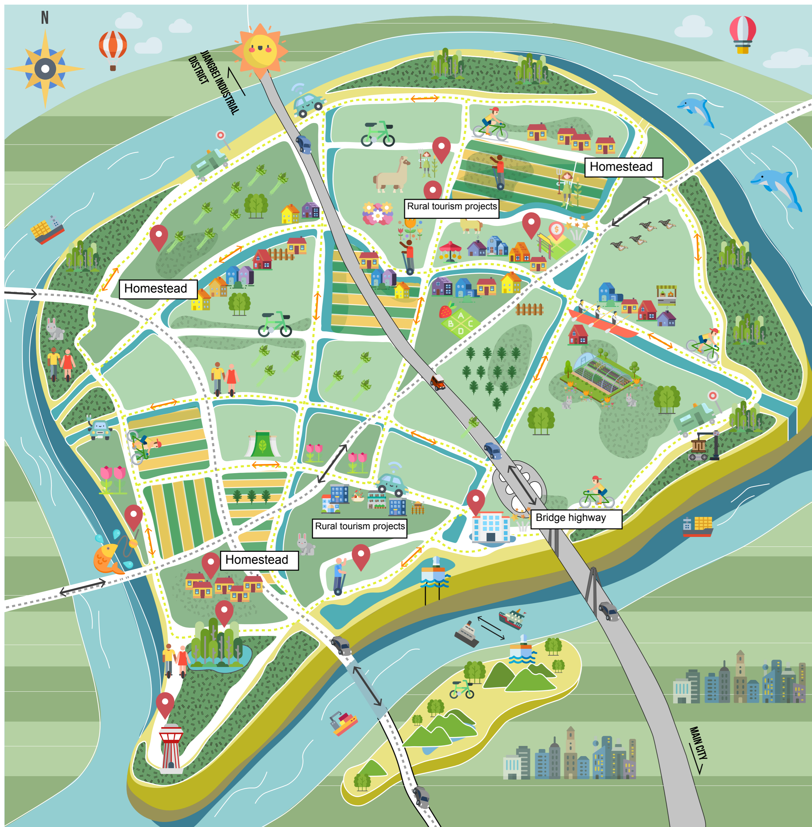
Figure 3. Overall vision of bagua island