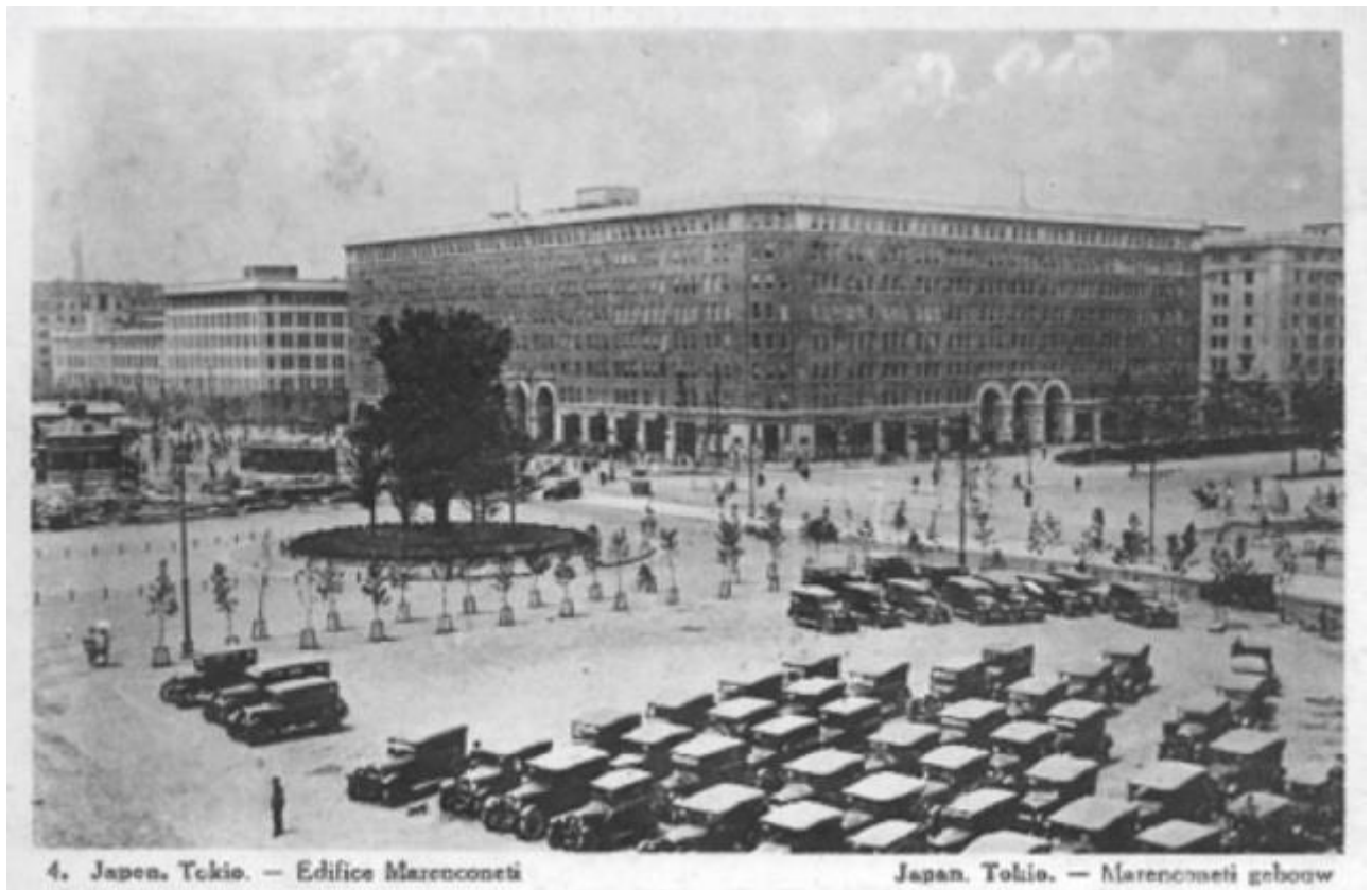
Tokio Edifice Marenconeti / Marenconeti gebouw (Marunouchi Building), picture postcard, 1926-1933, personal collection.

While searches in digitized text documents have gained ground in historical research, searching for image content remains a challenge. Metadata describes the content of images, but it takes a lot of time, competence, and commitment for archivists, librarians, and historians to acquire this information retroactively and add it to their enormous collections of images. Imagining the sheer amount of visual representations of architecture scattered around the world in archives and on servers, it becomes clear that only a fraction of this inventory is actually available for research.