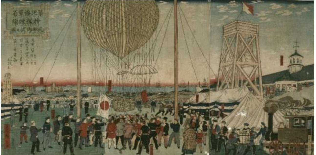
Utagawa Hiroshige: Hot air balloon test at the Navy Department in Tsukiji (Tsukiji kaigunshō...), 1877, triptych woodcut print, trimmed size

urban environment only by systematically canvassing catalogues of entire collections. The exhibition “Yokohama 1868–1912. Als die Bilder leuchten lernten” [Yokohama 1868–1912. When Pictures Learned to Shine] at Museum Angewandte Kunst in Frankfurt am Main, 2017, is a prime example: urban topics were depicted throughout the exhibition but the catalogue did not discuss the urban fabric. The same challenges apply to other artistic representations of the urban: sketches, aquarelles, and paintings, not to mention films and literature.