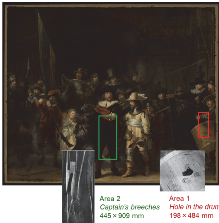
Figure 1. Rembrandt van Rijn, Officers and other civic guardsmen of District II in Amsterdam, under the command of Captain Frans Banninck Cocq and Lieutenant Willem van Ruytenburch, known as 'The Night Watch' , 1642, Rijksmuseum, Amsterdam 2,4 .

The Night Watch is a large oil on canvas painting with overall dimensions of 3.795×4.535 m (Figure 1). The original canvas support consists of three horizontal strips of canvas with two seams. Two inspected areas, including the Captain's breeches (0.5×1 m) and the drum (0.2×0.5 m), are marked in green and red rectangles. To minimize the exposure of the paint layers to the light and heat from the shearography heating source, these two areas were inspected from the reverse of the painting.