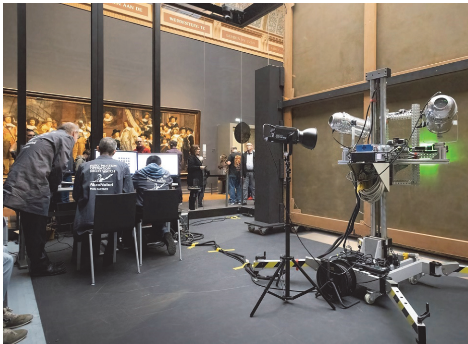
Figure 2. 3D shape shearography instrument positioned behind The Night Watch in the galleries of the Rijksmuseum

The painting was illuminated with the Torus 532 laser (optical power set to 150 mW, wavelength of 532 nm by Laser Quantum) through expansion optics, including a diffuser ED1-S20-MD by Thorlabs. The speckle pattern was imaged by four Pilot piA2400 cameras by Basler with Linos MeVis-C 1.6/25 lenses. Each camera has a Michelson shearing interferometer with temporal phase-shifting realised by a piezo-electric actuator PSH 4z (Piezosystem Jena). The individual field of view of each camera was approximately 210×180 mm. The suitable shear distance of 2.1 mm (approximately 24 pixels) in the horizontal and vertical directions was experimentally identified to produce reliable phase maps. Given that the shear amount was significantly smaller than the distance to the painting, an assumption was made that the shearography phase maps correspond to the in- and out-of-plane surface strain components.