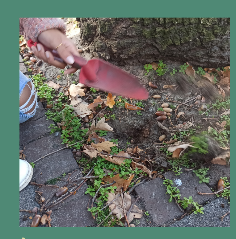
Turn the information into action