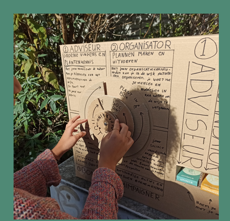
Personalize Interact with biodiversity wheel