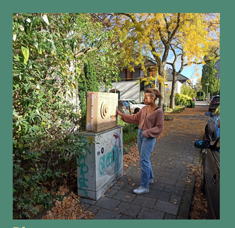
Discover Come across the biodiversity wheel

small-scale action to have a large scale impact.