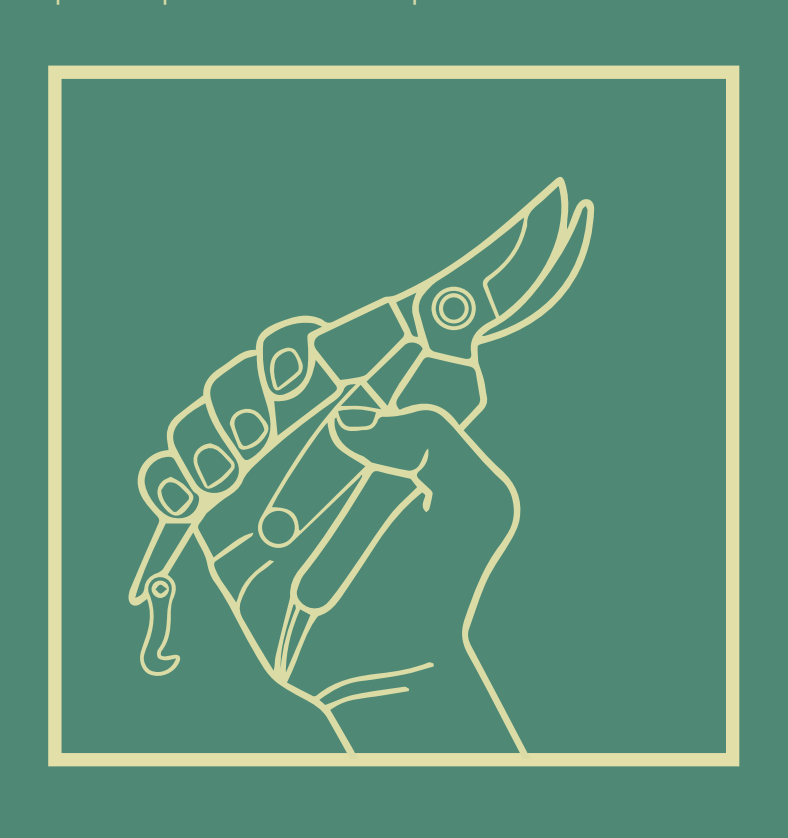
Value for initiatives

Become familiar with the possibilities of biodiversity action and get empowered to be part of the bottom-up participation landscape