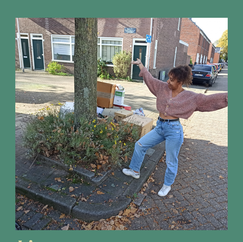
Join Join the bottom-up participation movement