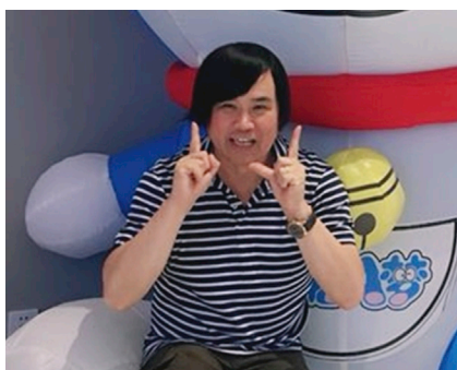
Huu Hao Ngo Centre for Technology in Water and Wastewater, University of Technology Sydney

In addition to minimizing our chemical footprints, the reuse of carbon-based wastewater components like plastic is a favorable wastewater-treatment approach and very possible; they can, for instance, be repurposed into construction building blocks or electro-spun fibers. Yet recovering the plethora of carbon-based organic chemicals remains a challenge given the plentitude of various chemical compounds. Adsorption/flotation or degradation with advanced oxidation are possible routes, but better wastewater management is needed to stop carbon escapes from nearly all current treatment systems.