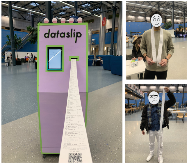
Fig. 1. Dataslip installation and reactions to the receipt.

limited it to five questions encompassing a broad range of products and services that most people encounter on a daily basis: (1) personalized public transport cards, (2) supermarket loyalty cards, (3) credit and debit cards, (4) wearables, including smartwatches and smart rings, and (5) mobile apps, including weather, navigation, web browser, email, instant messaging, music, social media, dating, and period tracking apps. The receipt contains a comprehensive list of the data generated as users engage with these different products and services. It includes short but detailed examples to help users interpret their data.