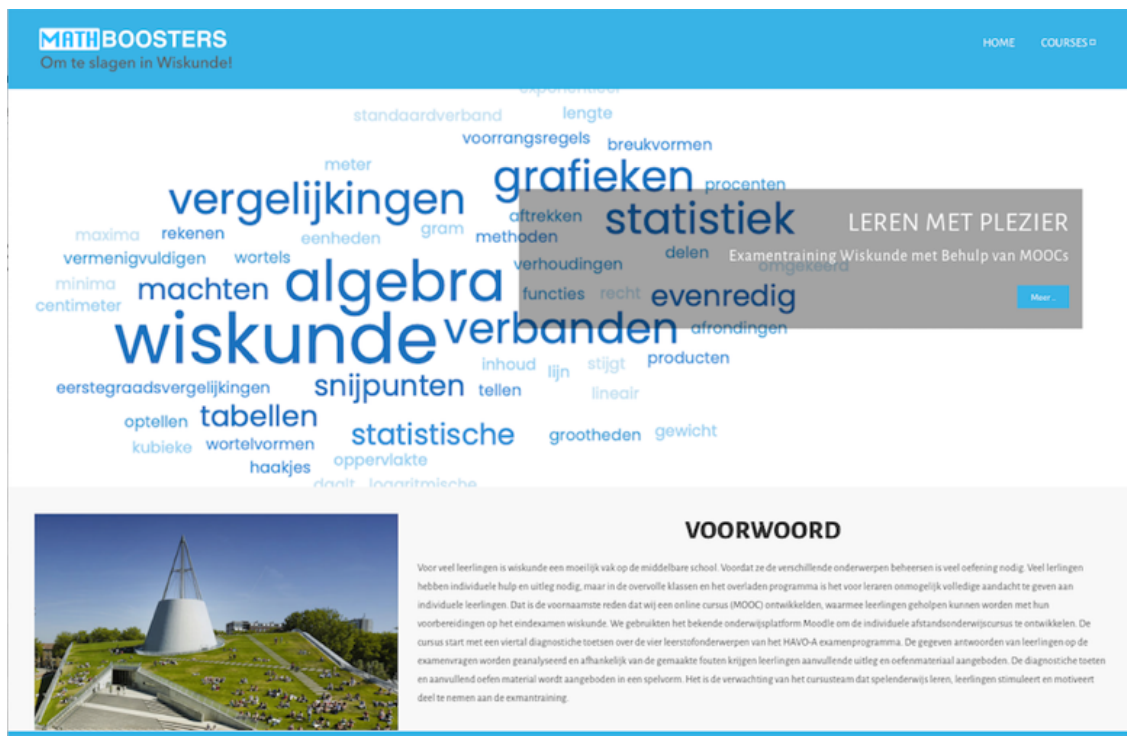
Figure 3: The homepage of the MOOC focused on math exam preparation for secondary school students in the Netherlands.

games, such as crosswords, can challenge and motivate students while also providing enjoyment. We have observed that subjects such as algebra and calculus are not fully developed in secondary schools, which poses a difficulty for many students, not just those with dyscalculia.