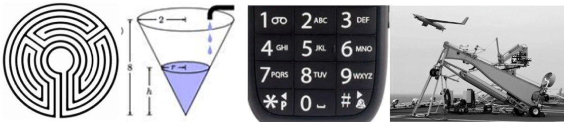
Figure 1: Mathematical assignments of real-life applications.

In another paper [3], the authors explore the impact of AI on online learning platforms. They compare the learning outcomes of two popular learning platforms: a traditional MOOC platform with video lectures and multiple-choice quizzes and a personalized, active and practical learning experience provided by the Korbit learning platform. The Korbit platform offers significantly better learning experiences, which is similar to our model.