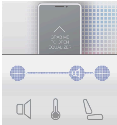
Figure 1: Graphical representation of media control