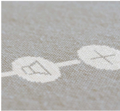
Figure 3: Close-up of possible graphical representation of volume use-case through woven fabric