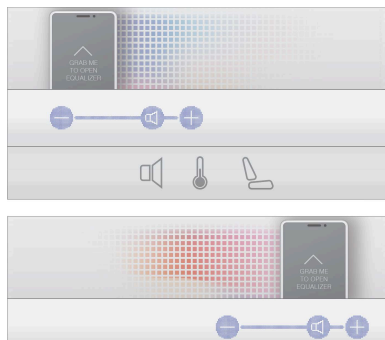
Figure 2: Graphical representation of positional interconnection with CED: the interface moves along with the CED

This paper reports on 1) a basic model how NDRA's, such as comfort and multimedia functions, could be represented physically, 2) the translation to a preliminary prototype that permits UI to be designed independently from the technology, and 3) next steps