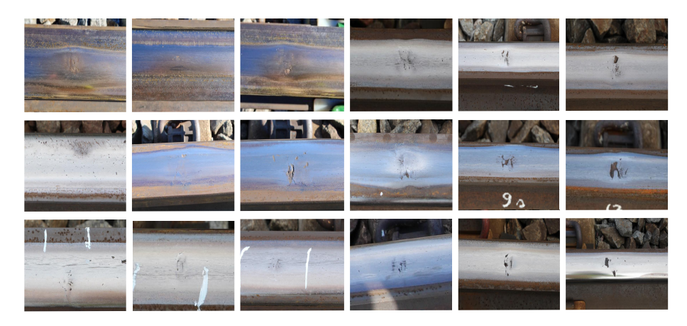
Fig. 2: Photos of some squats and other defects from validated locations.

In the first two locations, a total of eight rail defects were found over a length of over 2 km. At the last three locations, 51 rail defects were found over a length of approximately 1.5 km. These differences occurred because locations 1 and 2 were selected without prior analysis of the ABA measurements, whereas locations 3, 4, and 5 were selected based on the first round of ABA measurements. As the ABA detection method can indicate locations with an impact excitation energy higher than average values with a certain threshold, it detected all insulated joints and some locations of welds and small defects. Healthy welds ideally should remain undetected to the ABA system or exhibit a subtle response. Detected welds suggest an existing deteriorating condition that is typically associated with the presence of rail defects. Thus, to differentiate between faulty welds and rail defects themselves is not required. The ABA method can then be used as an indicator for weld quality control.