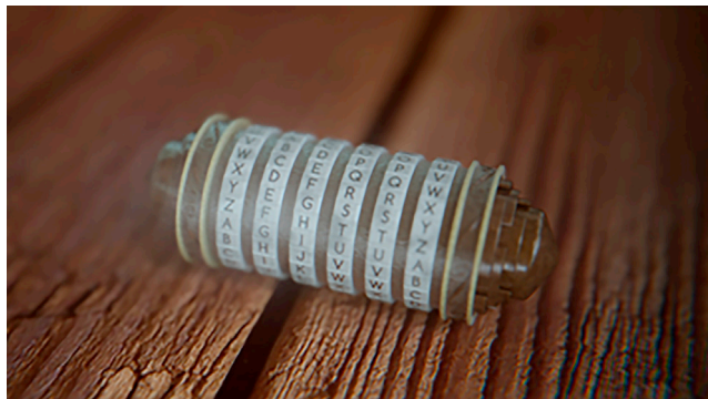
Figure 2. Single molecule protein sequencing will decode the proteome of the cell.