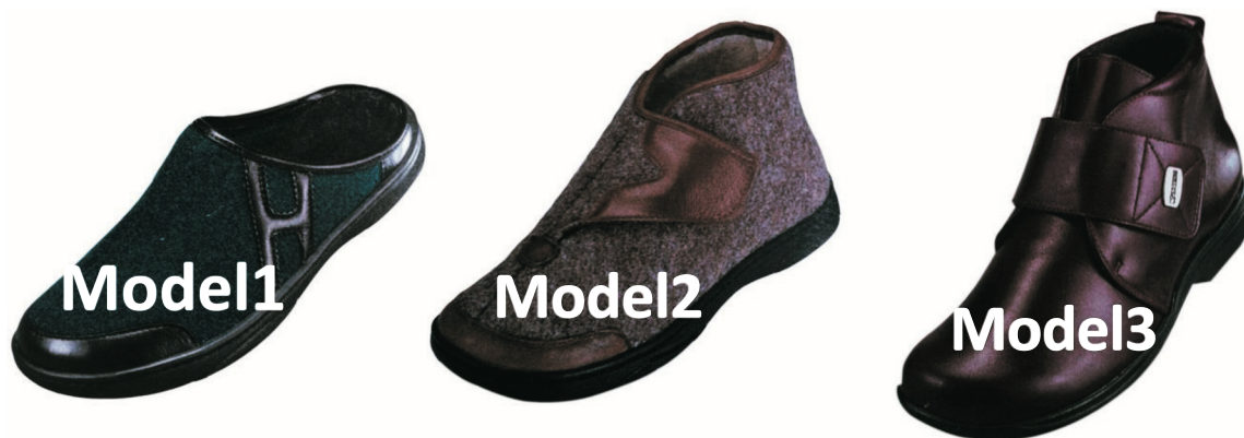
Fig. (1). Shoe models 1, 2, and 3.

In the current market of shoes there are several solutions to make a shoe fit to the foot shape.