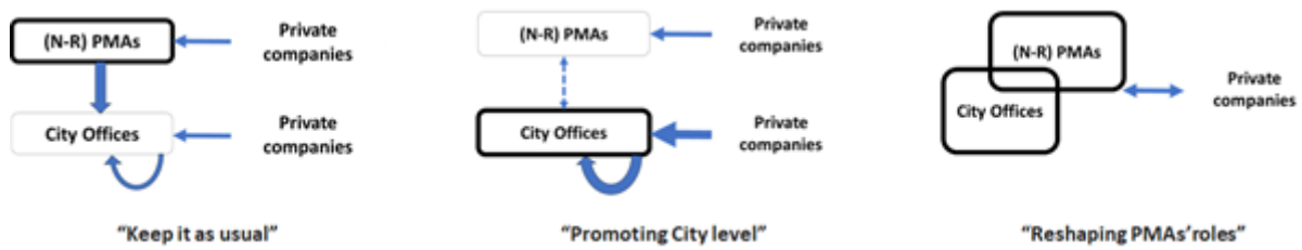
Figure 2. Data flow and Articulation between PMA and private companies in the three main approaches