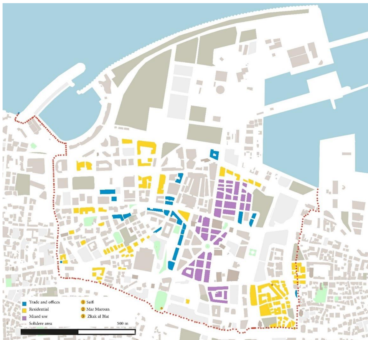
Figure 1. Ground plan of the Beirut Central District.