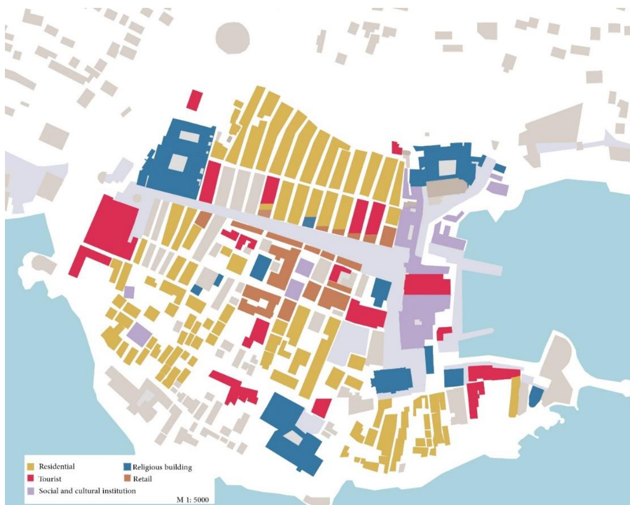
Figure 2. Ground plan of the Old City of Dubrovnik.