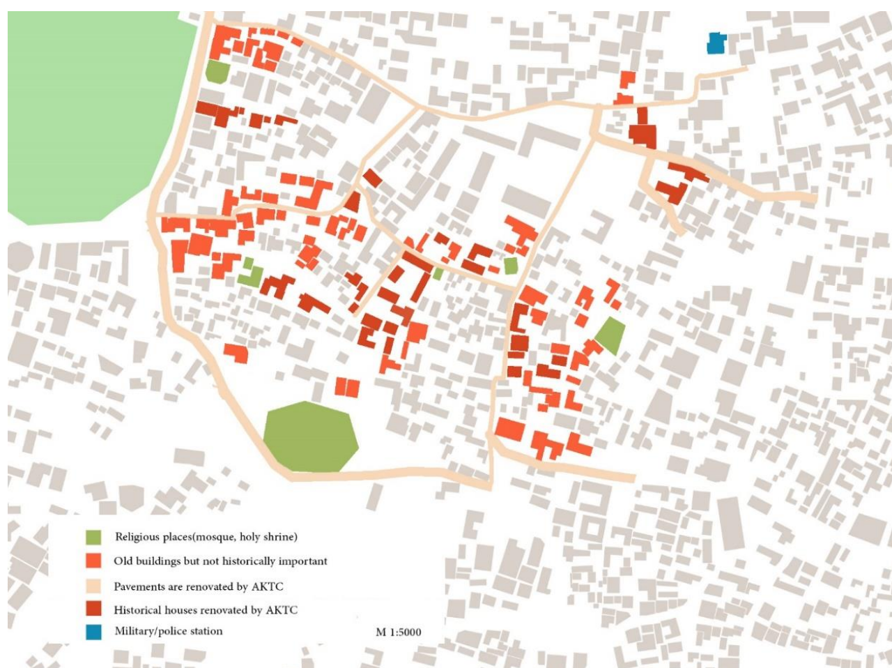
Figure 4. Ground plan of the historic city of Kabul.