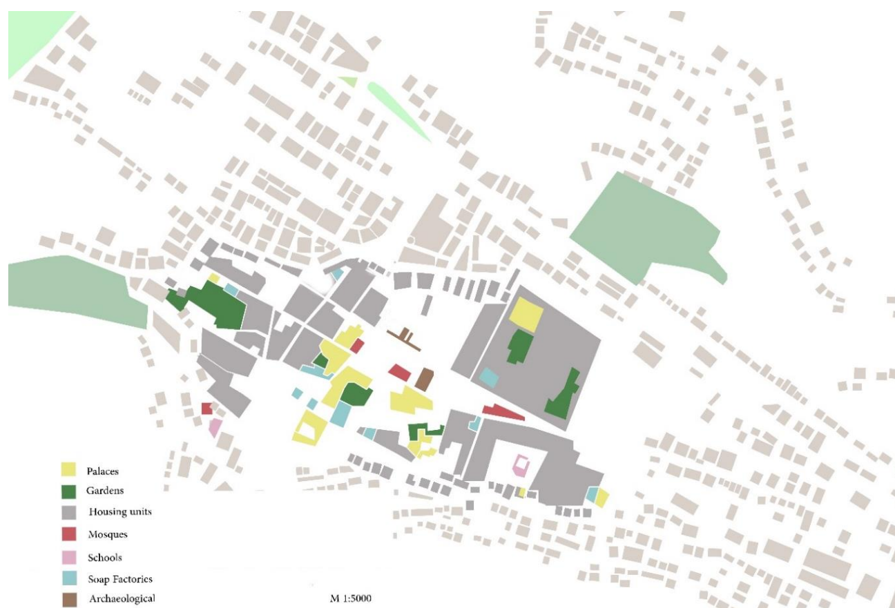
Figure 5. Ground plan of the Old City of Nablus.