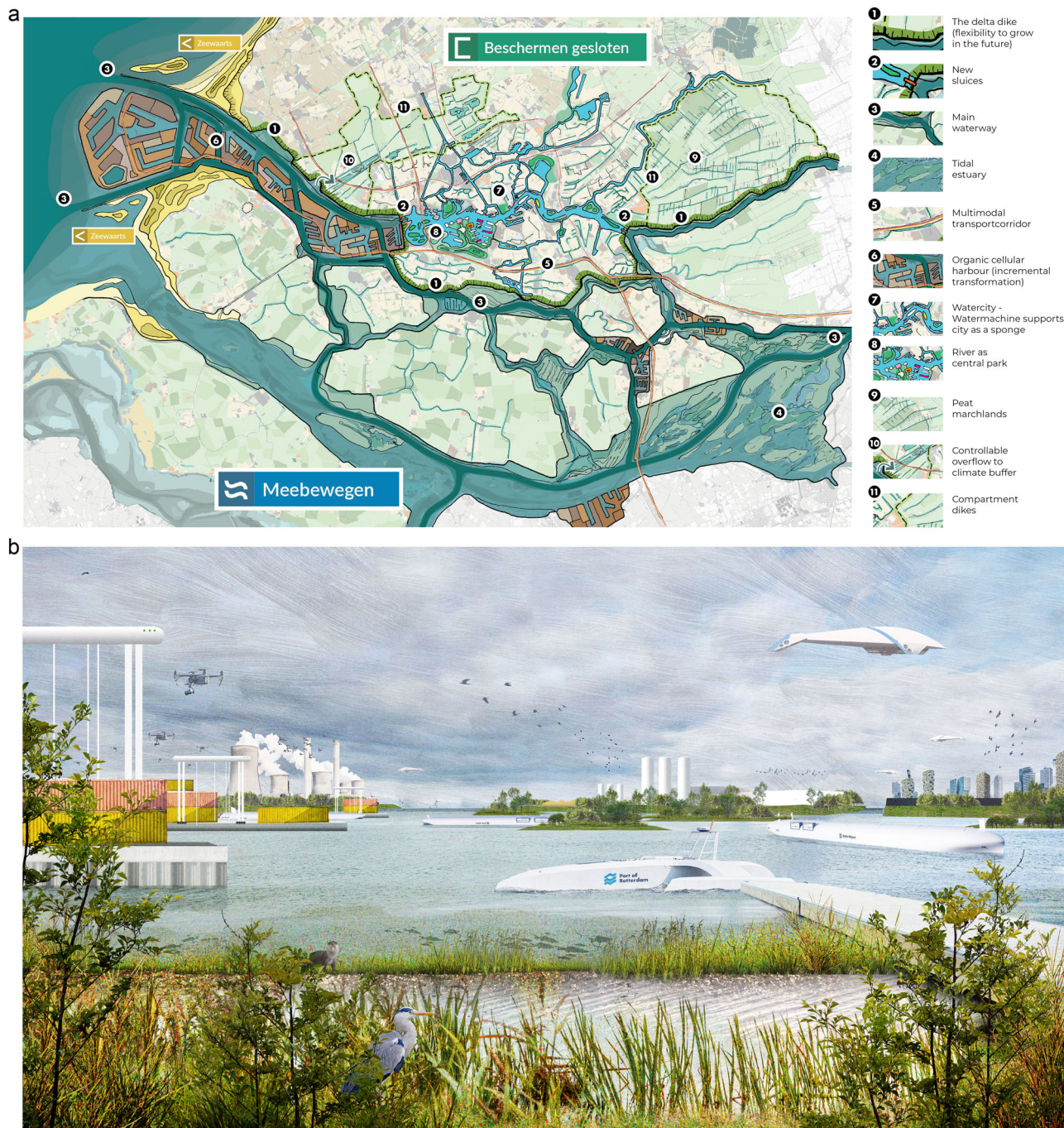
Fig. 2 | Envisioning the Dutch delta in 2022. Spatial design of a section of the Dutch delta (Fig. 2a) developed to protect the Port City area of Rotterdam. This will be achieved by rerouting the current flood defense (dike ring 14) and creating a sponge city. The port will continue to be elevated incrementally while simultaneously

transitioning to a green economy (see visual representation Fig. 2b). Design was created by Lola, Urbanisten and Royal Haskoning DHV in 2022 as part of the Redesigning Deltas Design Study 22 . Written permission for its use has been granted.