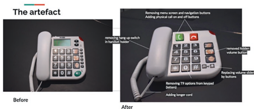
Image 16.6 Picture memory phone before and after modifications

One of the most motivated groups that took the assignment very seriously; one of the students' mother worked as a nurse with people with Alzheimer. During the workshop, they called her (several times, I believe) in order to make the best design choices. Her recommendation in nutshell was to get rid of anything unnecessary.