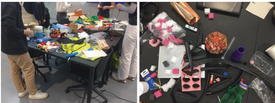
Image 16.1 An overview of tinkering material

We received funding from our department to purchase scrap materials used for tinkering (see Image 16.1) and 15 artifacts, including a tricycle walker, a dressing stick, a foldable walking cane, hearing aids, and a picture memory phone designed for people with dementia (see Image 16.2). We should note that students were not restricted to these purchased artifacts. Using a suggestion from Student Onbeperkt – TU Delft’s student-run organization for students with a disability – we