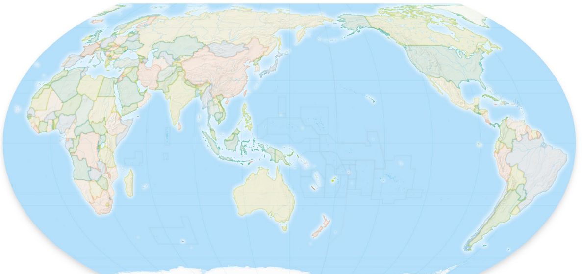
Figure 2: Same world, different view - the Equal Earth projection demonstrating true sizes of nations relative to one another, set at 150 East Questioning world view and Western bias.