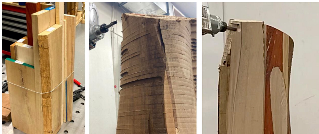
FIGURE 1 Packed, glued (left) and milled (middle and right) reclaimed wood boards serving as curvilinear beams for a larger structure.

D2RP efficiently links computational design with robotic production. It involves subtractive and additive techniques such as cutting and milling into materials such as plastic, wood, etc. and robotic 3D-printing with materials such as clay, plastic, etc., respectively (Bier, 2018; Bier et al., 2020). When equipped with various end-effectors robotic arms are versatile and in combination with Machine Learning (ML) models that accurately simulate the process and predict how processes evolve over time, and optimal settings can be identified (Peters et al., 2011) to optimize energy consumption and thereby reduce material use and processing time.