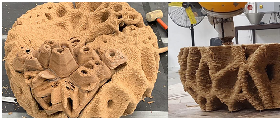
FIGURE 3 Wood-based polymer 3D-printed 'planetoid'.

Support-free 3D printing is achieved by controlling the angles of the Voronoi cells to be within the printing constraints that take into consideration the maximum achievable printing angle, which depends on the viscosity of the material at extrusion temperature as well as cooling i.e., crystallization speed. The printing angles are limited to 45-55 degrees in relation to the printing bed. Since the Voronoi-based cellular structure is an inherently stable self-supporting type of geometry, the cells can be printed at more extreme angles, while continuous toolpaths ensure that the printing process is efficient. The prototype was subdivided into multiple components, allowing the 'planetoid' to be printed in smaller parts. Based on this strategy larger objects are assembled from multiple components (Fig. 3). The size of the assembled object is thus not limited to the size of the 3D printing system. Also, easy transportation and assembly are accounted for.