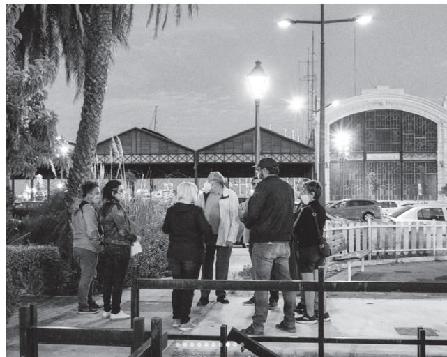
Figure 5 – Walk approaching the Tinglado from the surrounding areas, 2020

In the period 2015 to 2019, Carpe Studio developed a three-phase project in the neighbourhood of Orriols (Valencia):