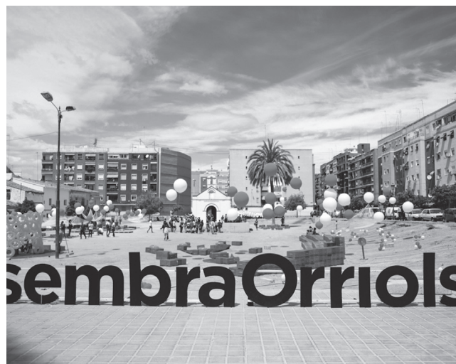
Figure 3 – Prototyping at the Plaza de La Ermita during Sembra Orriols , 2015

Some authors have labelled this boom in the direct participation of citizens in the creation and management of public space in Valencia as “participatory reactivation” and conclude that it is a complex, heterogeneous phenomenon whose results play a fundamental role as a catalyst for public administration 6 .