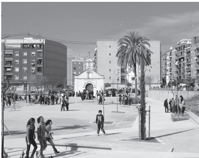
Figure 4 – Design by E. Quintana based on the participative process, 2018

make the Botànic: results and presentation of lines of action), three working group meetings, an information office open for four months in the market and the neighbourhood library, surveys, work sessions in schools and personalised interviews with interest groups.