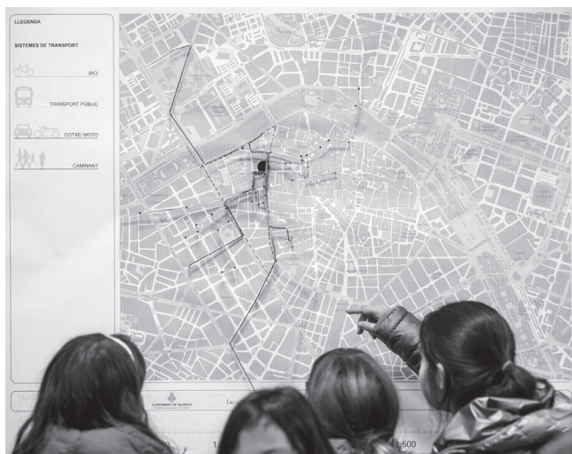
Figure 2 – El Botànic es mou : “Move around” workshop, 2016

citizens’ opinions. In the Spanish context, the implementation of social and cultural variables in urban space design started with the democratic transition in the early 1980s. Promoted by the appearance of citizen movements committed to improving the quality of urban space, the model of city design timidly began to incorporate dialogue with citizens. Through opinion columns in the newspapers, project exhibitions, demonstrations or posters, the collective debate began to take shape and inform the political and spatial decisions of the city 4 .