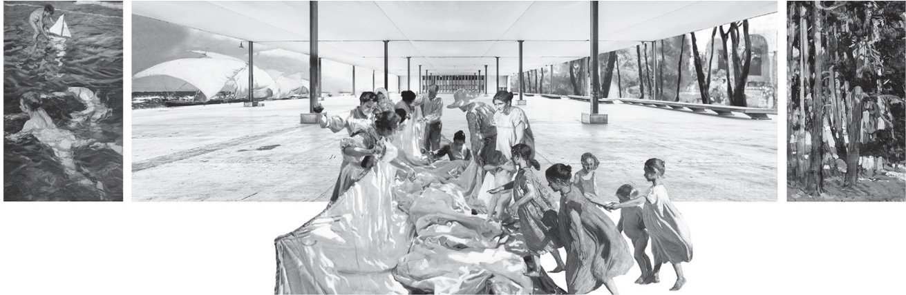
Figure 6 – Collage image of the Tinglado and pieces of Joaquin Sorolla's paintings, 2019