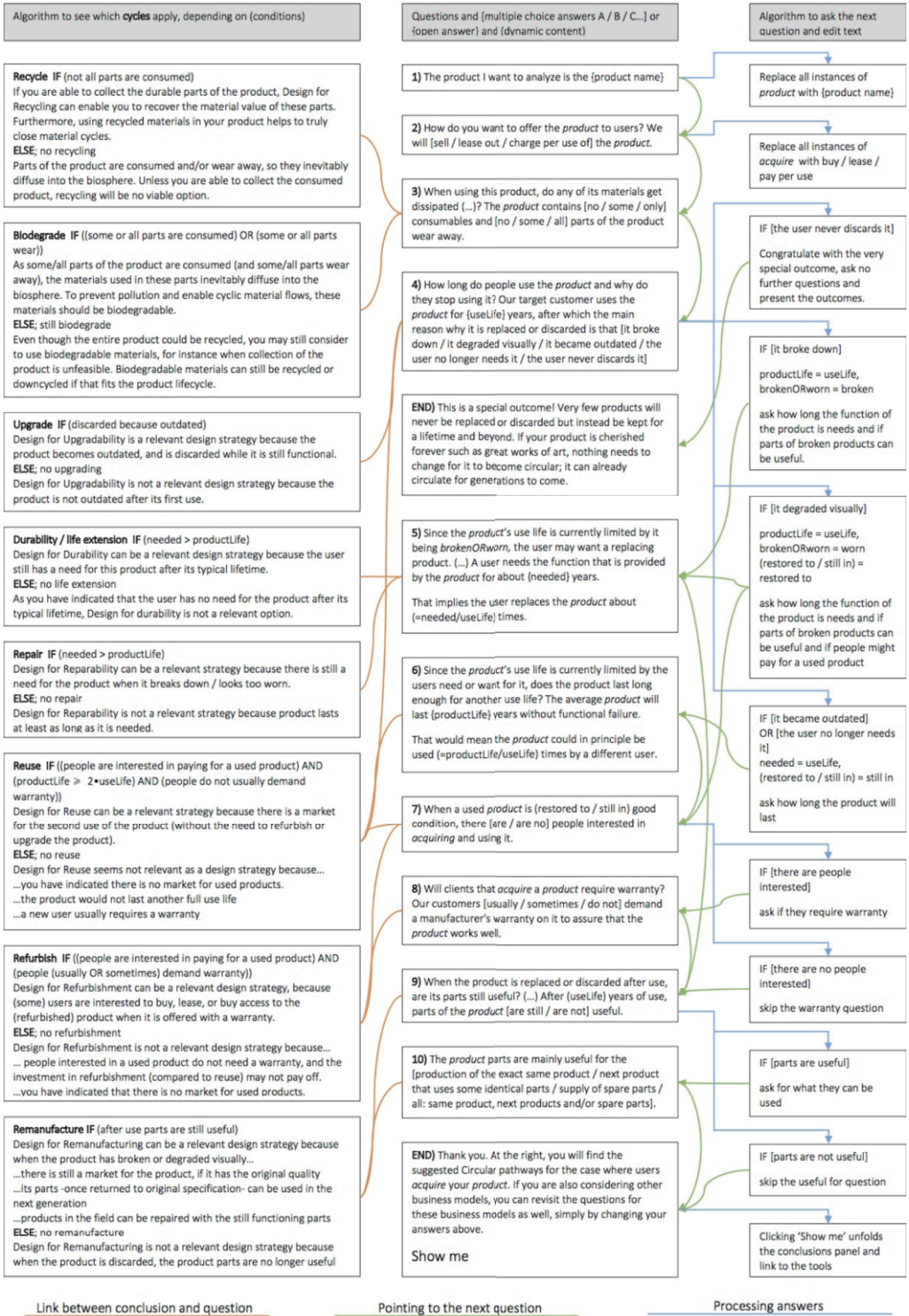
Figure 2. Heuristics underlying the tool.