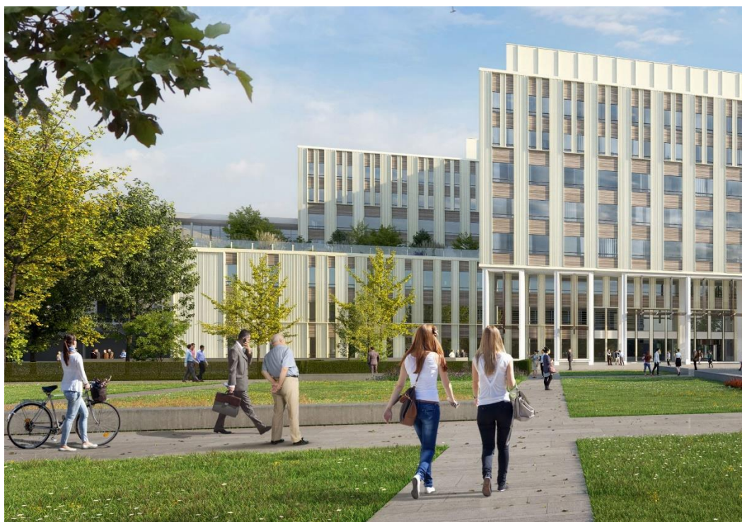
Figure 3. Impression of the entrance of the main building, which integrated the EBD principles of daylight, nature, orientation.

For the design of the inpatient rooms two separately funded studies were conducted to inform the design. The findings of these studies were applied in the design of the patient rooms. The studies were called “Ban Bed centricity” (Koenders et al., 2018) And “Room with a View/R4HEAL” (Hesselink et al., 2020). The studies focussed on better recovery of the patients, through integration of systems that enable patients to adjust the conditions of their rooms to their personal needs. The patients can regulate environmental stimuli such as lighting, shading, distraction through audio-visual entertainment. Also, their close relatives can stay (rooming in) for support.