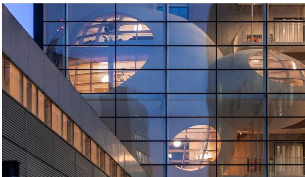
Figure 1. The special hub designed as floating pebbles.

On the large scale, orientation within the complete hospital along the main corridor will be improved due to compact design. The main axis will be shortened from 1.200 m to 200 m. The main axis is connected to the atrium and entrance of the hospital. New staircases and clearly defined meeting points (“hubs”) are realized. There are several types of hubs, for education, knowledge, public and a special hub. The hubs vary in enclosure, materials, colour, and shape to support orientation. In the special hub is a living room for parents and their ill children in the shape of floating pebbles, see Figure 1. The curved shapes provide intimate places for private conversation and intimacy. Furthermore, the pebbles provide an orientation point through their extraordinary shape and scale. The hubs are designed to support orientation, privacy, interaction.