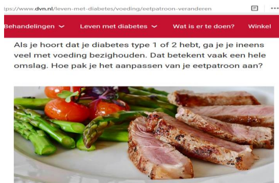
Figure 2: Food page of www.dvn.nl directly contradicts www.dvn.nl advise.

Apart from the similarities, also summarized in Table 1, it is interesting to see that www.thuisarts.nl is more directed towards medication and 3-monthly checks for complications. Whereas the other two sources explain the causal roles of health behaviors and insulin sensitivity better.