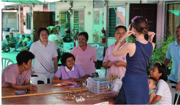
Community leaders Bangkok

finding solutions and creating opportunities for themselves and others. They are agents of change who contribute to social development and gender equality. As an example in South Africa 53% of the 98,920 non-profit organisations (NPOs) are community-based organisations (CBOs), 60% of NPO employees are women, and 49% are volunteers (Swilling & Russell, 2002).