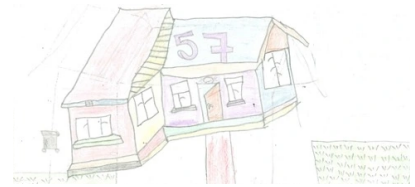
Drawing of a house in Victoria Mxenge by an 11 year old girl