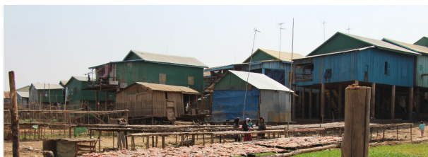
Women play a crucial role in this small riverside community in Phnom Penh, where fish loans provide a sustainable source of income and promote economic empowerment.

At the dawn of International Women's Day , I want to highlight the importance of feminist solidarity and the need to amplify the voices of these women who have been at the forefront of local organisations and planning in their communities. Too often, these women have been overlooked in the writing of (planning and design) history. By celebrating their contributions, we honour their work and challenge dominant narratives that perpetuate the erasure of women's experiences and perspectives.