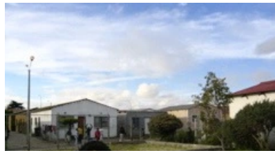
Victoria Mxenge community centre